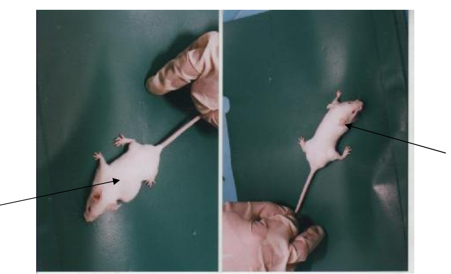
Not treated mice Treated with laser Fig.(1):Show gross observations of the diseased mice before and after treatment with laser.