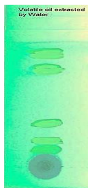
Fig.(1): TLC chromatogram.

The spectral data of isolated compounds were shown in Table (2), and Figs. (2,3,4 and 5) were shown that compounds 1 and 2 exhibits a broad band appearing in 3267-3485 \text{cm}^{-1} assigned to the stretching vibration of (OH) group. While compound (3) exhibits the band 1750 \text{cm}^{-1} was related to C=O stretching. Compound (4) exhibits the following bands, 3080 \text{cm}^{-1} was due to the aromatic C-H stretching band, 2982-2858 \text{cm}^{-1} was stretching due to the C-H methyl group, 1539 \text{cm}^{-1} was due to C=C stretching of ring besides other characteristic bands. Compound (5) exhibits the following bands, 2976 \text{cm}^{-1} was due to the alkan C-H stretching band, 2862-2911 \text{cm}^{-1} was stretching due to the C-H methyl group, 1444 \text{cm}^{-1} was due to C=C stretching and 1381 \text{cm}^{-1} .